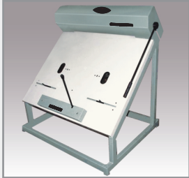
Single Edge Plate Punch & Bender