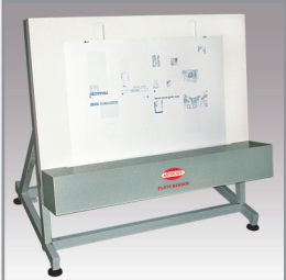
Single Edge Plate Bender