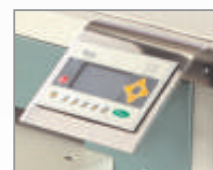
PLC Control & Display