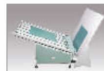
Optional: Automatic Plate Stacker