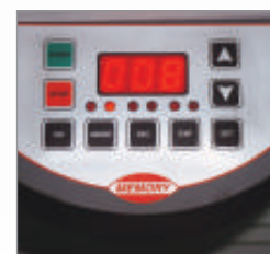
Feather Touch Control Panel