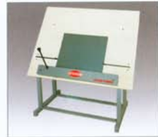
Hand Operated Plate Punch for Sheet-fed offset