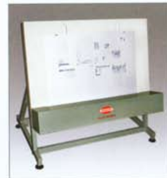
Single Edge Plate Bender for Sheet-fed Offset