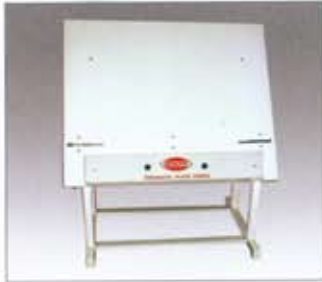
Pneumatic Plate Punch for Newspaper Presses