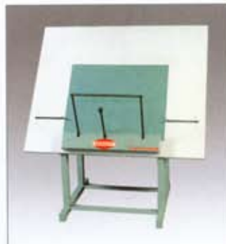
Hand Operated Plate Punch for Newspaper Presses