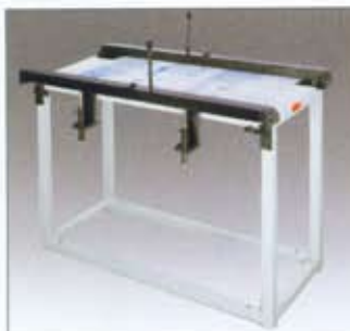
Manual Plate Bender for Newspaper Presses