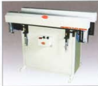
Pneumatic Plate Bender for Newspaper Presses