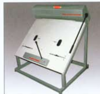
Single Edge Plate Punch & Bender for Sheet-fed Offset