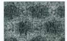
Range of Patterns